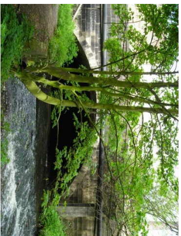
The Walk at Waterhouse Bridge, which carries the A6 trunk road over the River Douglas.

Here is the boundary between Adlington and Blackrod, Lancashire and Greater Manchester, and the ancient hundreds of Leyland and Salford.