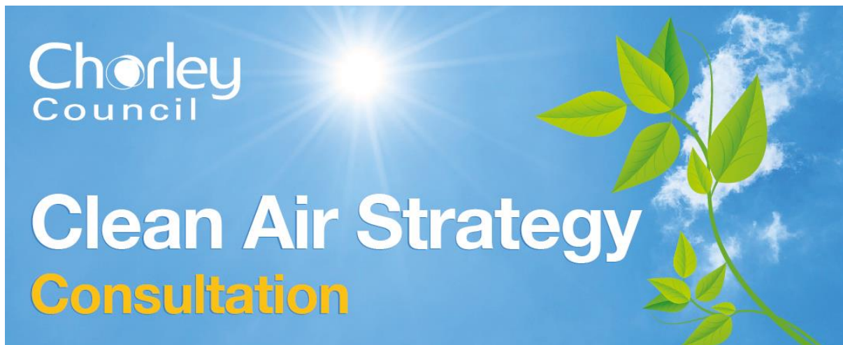
FIGURE 4: CLEAN AIR STRATEGY BANNER