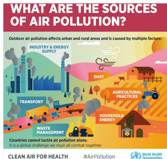
FIGURE 2: WHAT ARE THE SOURCES OF AIR POLLUTION? INFOGRAPHIC FROM THE WORLD HEALTH ORGANISATION