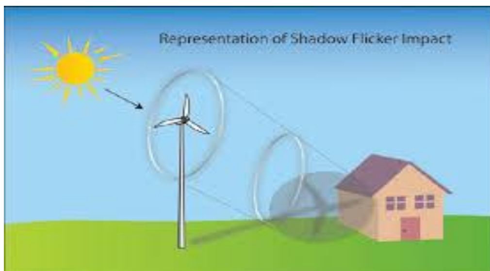
Figure 1: Shadow Flicker – Representation of impact